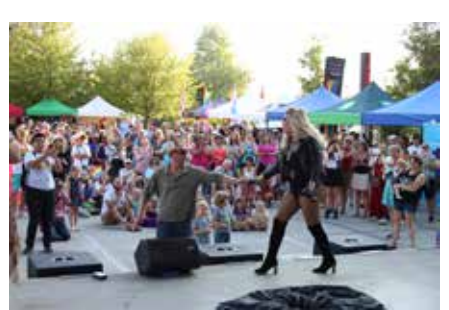
A crowd gathers for an interactive drag performance at the North Vancouver Ship Builder's Square.

Pride at the Pier (previously Prance on the Pier) was presented with the support of the City of North Vancouver. The event, now in its second year, was a resounding success and saw an increase of at least 500 attendees. New additions included more community partners, a flag-making station, a games room, an increase in drag performances, and Drag 101 where attendees could meet and ask the performers questions. VPS media partner North Shore News promoted the event including a four page feature.