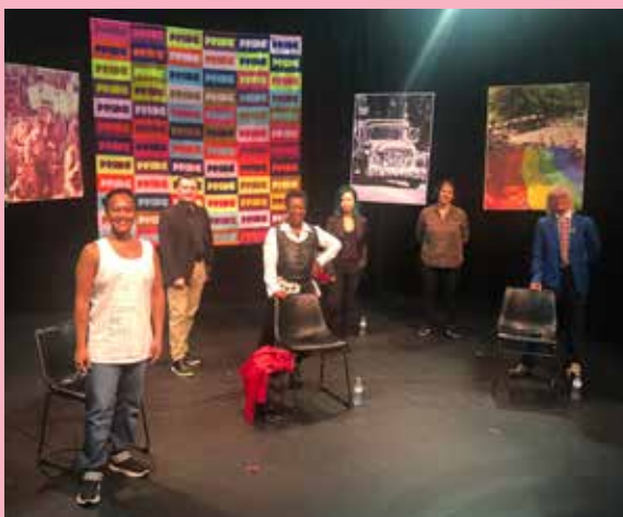
Panelists and Moderator of the Queer History Panel.