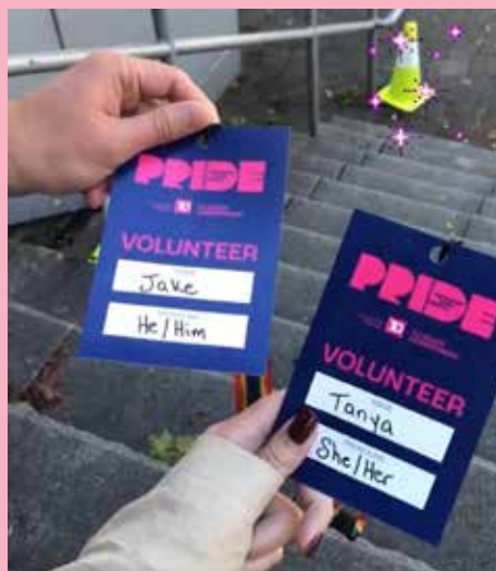
Volunteer name tags for the 2020 season.

These folks volunteered for a number of roles, including pre-planning for the Parade as the Parade Working Group, being on site at the Pride Art Walk, and as seat fillers while filming the Virtual Sunset Beach Mainstage Show. Though we could not see as many volunteers in person this year, we still worked to show our appreciation by creating a new Vancouver Pride Volunteers Facebook Group, and by offering volunteers some special perks and prizes. Thank you to everyone who stood with us and volunteered for the 2020 season, and thank you to the folks who did not but still shared their support!