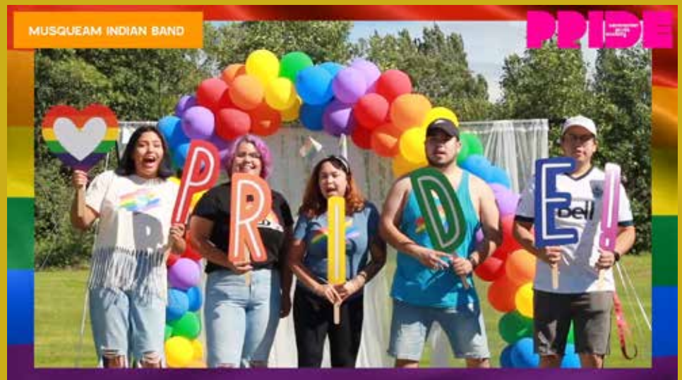
A screenshot of Musqueam Indian Band's Virtual Parade Entry