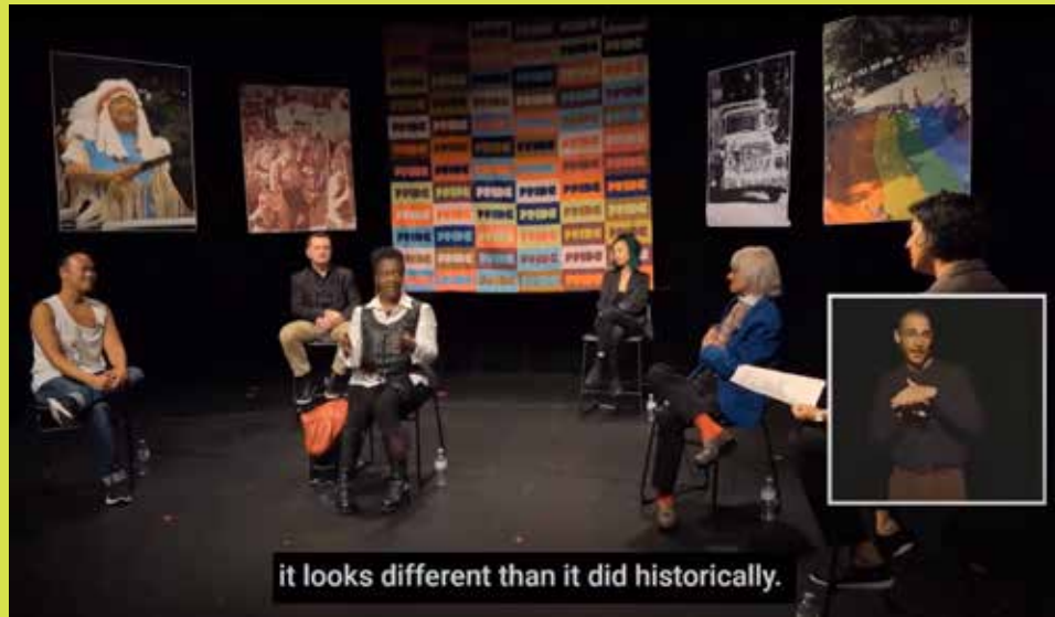
Screenshot from the 2020 Vancouver Queer History Panel.

Due to Covid-19 and the cancellation of live events, in 2020 all VPS events pivoted to digital platforms, the majority of which were live streamed video. All streams were free and available to watch on Facebook Live, Twitch, YouTube and on the Vancouver Pride website. A multi-platform approach was selected to allow the end user to select the platform they felt most comfortable with. All videos were made available on Facebook and YouTube for community members to access after they premiered.