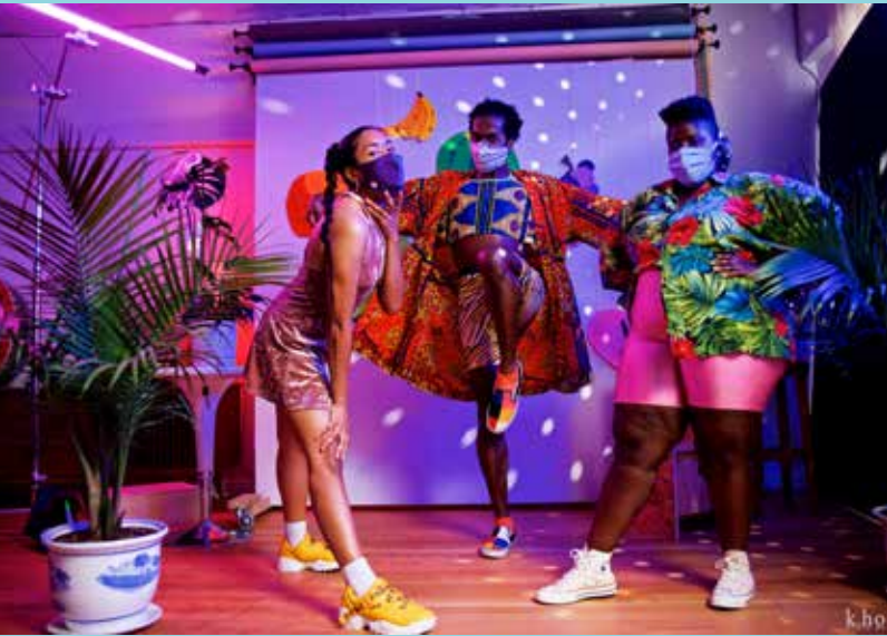
FlyThems pose for the camera during a shooting break.