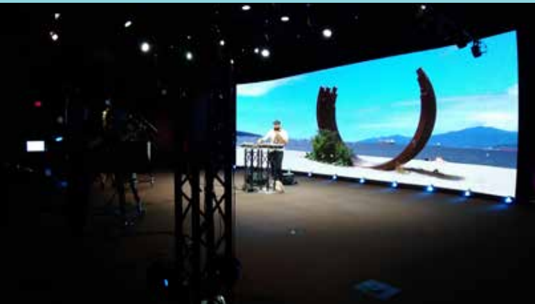
Behind the scenes filming for Virtual Sunset Beach, featuring DJ Abasi.

A long held tradition of post-parade celebration is typically held at Sunset Beach Park. Like with our virtual parade, our “Sunset Beach” main stage and headliner performances were also broadcast virtually.