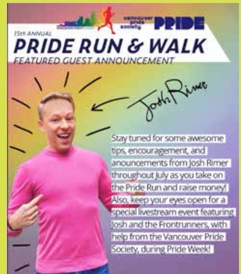
Vancouver Frontrunners social channels

Since 2014, the VPS has partnered with Vancouver Frontrunners to host the annual Pride Run Walk along with Picnic in the Park. The 16th Annual Pride Run & Walk had to be held virtually over the month of July this year. Participants were encouraged to run or walk 5k-10k in their neighbourhoods and to collect donations along the way. There were many opportunities for participants to win prizes during various photo contests and a final draw on July 31st. The month-long event attracted 140 registrants (21 from outside of BC), who all received a $15 Subway gift card. This socially distanced event provided a welcome opportunity to get outdoors and raised over $16,000 with funds benefiting Out in Schools and Pride Youth Scholarship fund.