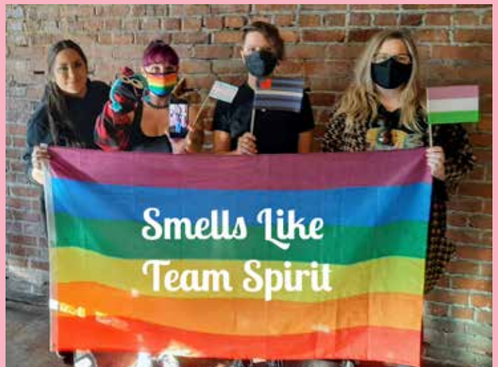
The winning team from game 3 of Vancouver Pride Scavenger Hunt. Smells Like Team Spirit photo

14 I am thrilled that you are looking for ways to engage the community during this weird time. Thanks for all you do ♥ —VPSH participant