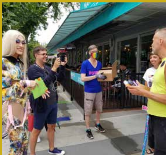
Visiting Jim Deva Plaza.