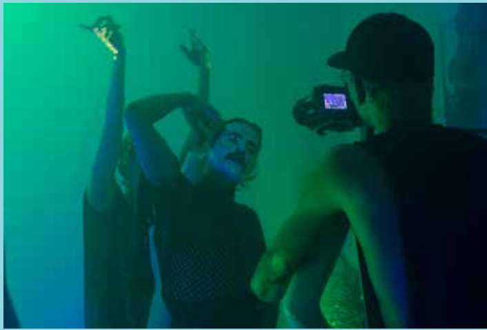
Behind the scenes shot during the filming of Kaleidoscope featuring Continental Breakfast.